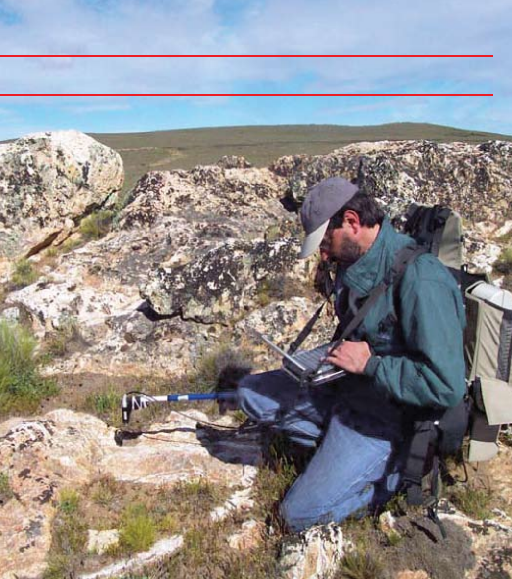
Chubut area: compiling in situ spectral database

uranium equivalent, while about 1% have values ten or more times higher.